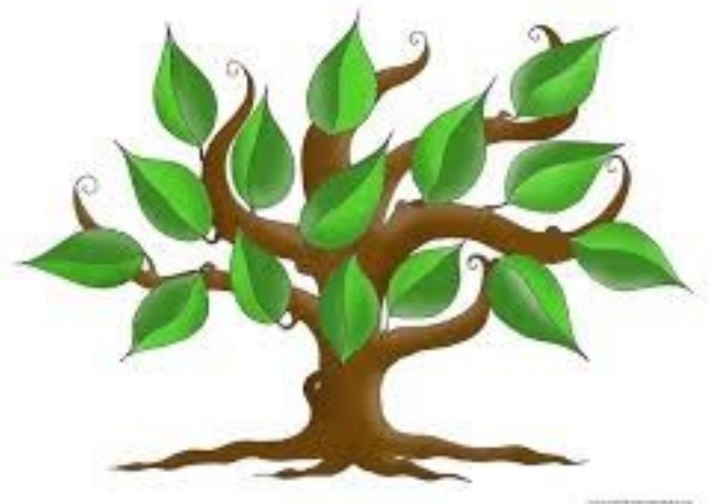
My Family Tree

“What a dear old wall that is that runs along by the river there! I never pass it without feeling better for the sight of it. Such a mellow, bright, sweet old wall; what a charming picture it would make, with the lichen creeping here, and the moss growing there, a shy young vine peeping over the top at this spot, to see what is going on upon the busy river, and the sober old ivy clustering a little farther down! There are fifty shades and tints and hues in every ten yards of that old wall. If I could only draw, and knew how to paint, I could make a lovely sketch of that old wall, I'm sure. I've often thought I should like to live at Hampton Court. It looks so peaceful and so quiet, and it is such a dear old place to ramble round in the early morning before many people are about.” ~ Jerome K. Jerome, Three Men in a Boat (To Say Nothing of the Dog), 1889.